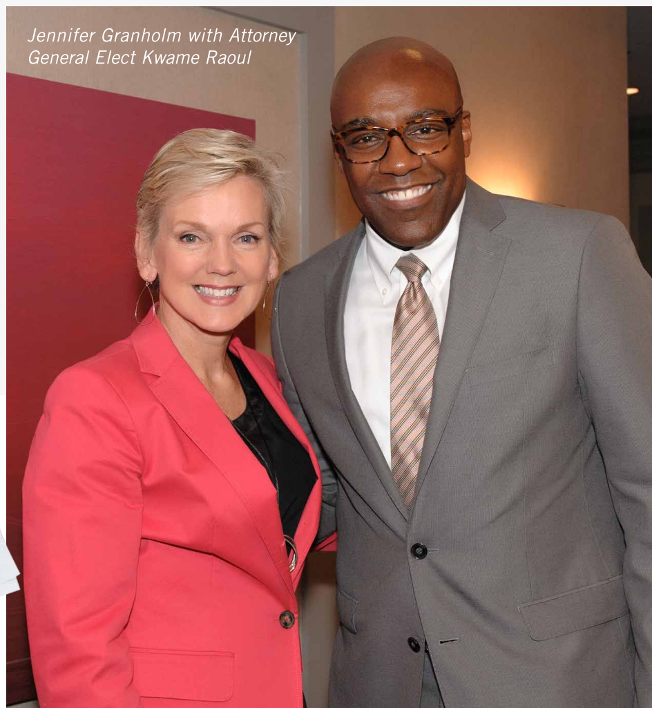
Jennifer Granholm with Attorney General Elect Kwame Raoul

Personal PAC's Annual Awards Luncheon is the organization's primary fundraiser. We thank everyone who was able to attend and contribute to the event.